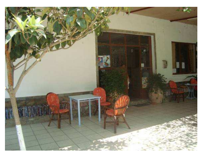
Finally a note: in many villages, the mini market is also the post office. Since there are no street names, the entire incoming mail is delivered to a collection point and every resident comes there to pick them. Pleasant for men in Crete that there very often a Kafenion is close to it!