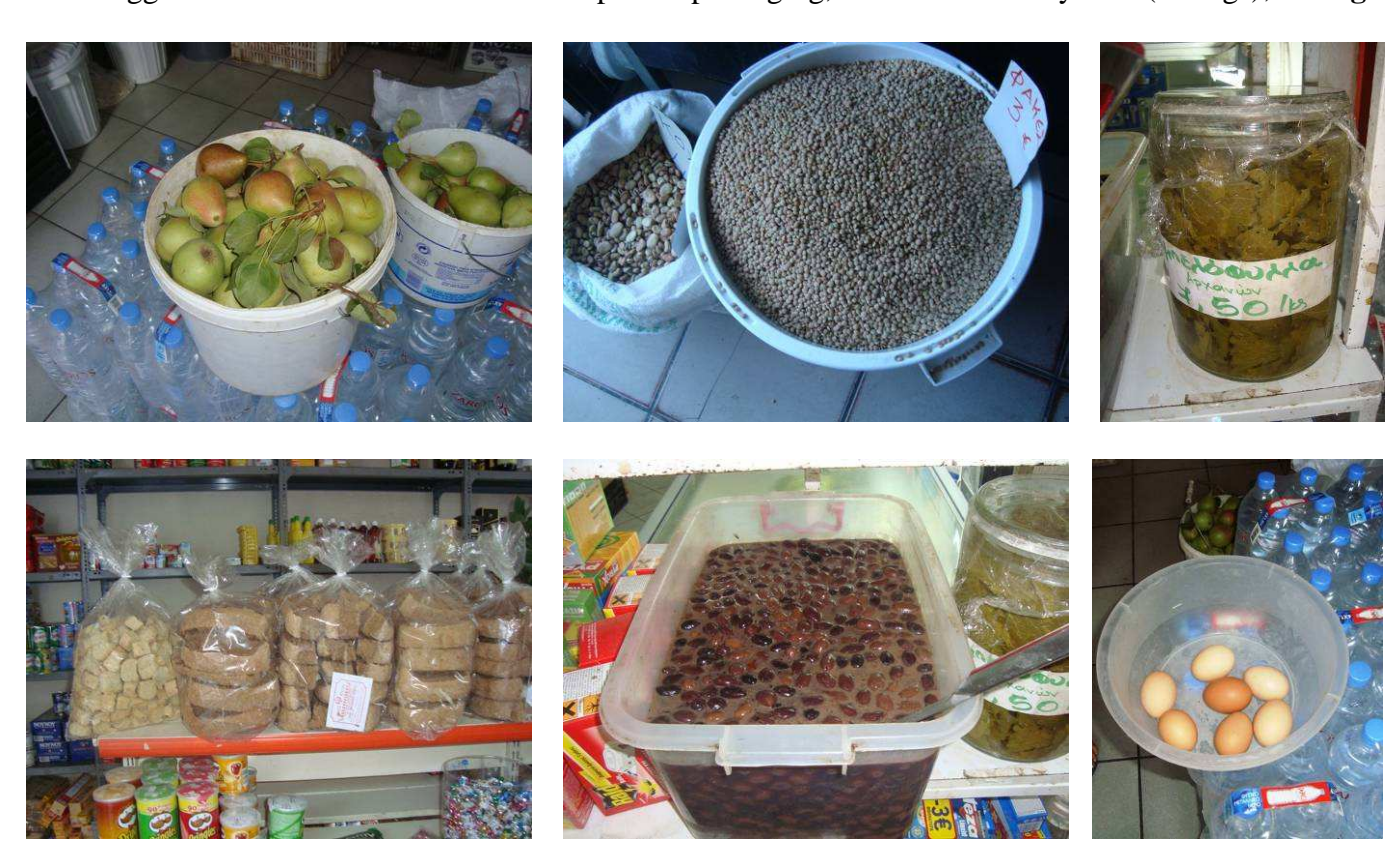
Look at one or more of these small, sometimes quite dark shops at Crete; it's an experience for the senses!

Fresh eggs? Here you know, they are fresh and not from an "egg fabric" but from a local of the village. These eggs are of course not in the 6 series plastic packaging, but offered in any dish (or bags); see fig.