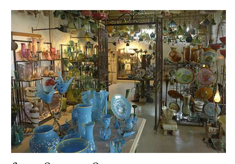
from 8 am to 8 pm.

You get to the glass blowing workshop of Andreas Tzompanakis in Kokkino Chorio while driving on the North coast of Crete, East of Chania, from the village Kalives towards the village Plaka. In the well-known resort of Almirida, you follow the road along the sea until you reach the junction on the left to Plaka. In Plaka even stay on the wide main street, until you get to the end of the village where you must turn right uphill to Kambia. In Kambia, a sign indicates towards Kokkino Chorio. Once there, turn right at the first crossroads after the village entrance sign. Here you see the building of glass blowing workshop already left. The showroom (see fig.) is daily open