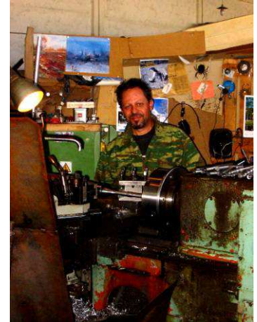
The “boss” in the entrance hall, his coworkers at the workbench and lathe / below pictures: MINOS product types from the brochure.