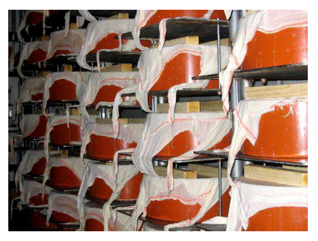
The illustrations above show work procedures to the storage and mature of the cheese; also the well known "Feta", which can be tasted and bought also in the attached sales shop.