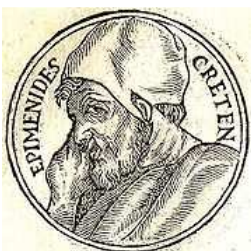
Fig. left: Epimenides from "Promptuarii Iconum Insigniorum"

Thus “the Epimenides paradox” is actually none, because the implication "all Cretans lie", says the Cretan" read: If all Cretans lie, this Cretan lies as well. So the statement is wrong. But the negation of this statement is NOT: “All Cretans tell the truth” - but rather “not all Cretans lie”. The logical implication is: There is at least one Cretan telling the truth but it is not Epimenides, he lies.